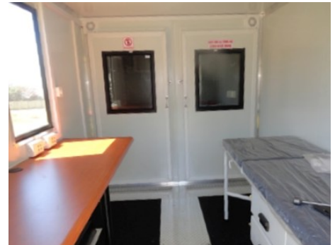
The audiotrailer has two sound booths