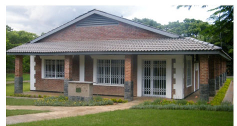
The smart entrance to the HCTC