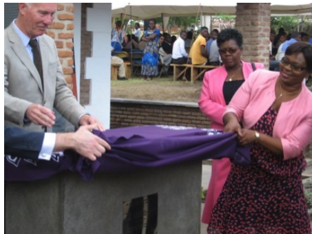
Malawi's Minister for Health unveils the plaque