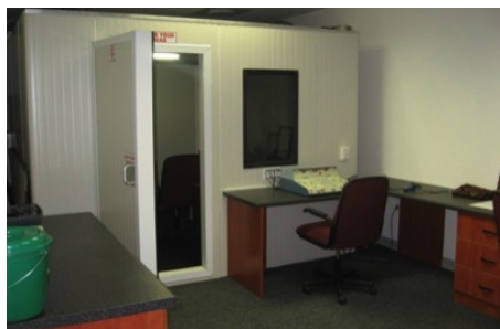
The Centre has two sound booths