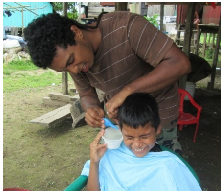
This lad is not enjoying having his ears cleaned out!

In 2014, MMI will allow volunteers to travel to these regions and work with the medical teams and alongside hearing screeners. If you are a hearing health professional, why not consider putting your hand up for a trip? Email admin@earsinc.org if you would like more information.