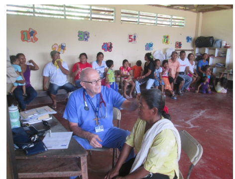
The MMI medical teams attended to hundreds of patients