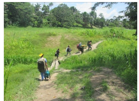
Trekking between clinics