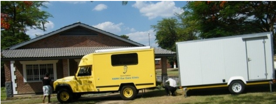
The HARK vehicle and audiotrailer hooked up and ready to take hearing services out to communities