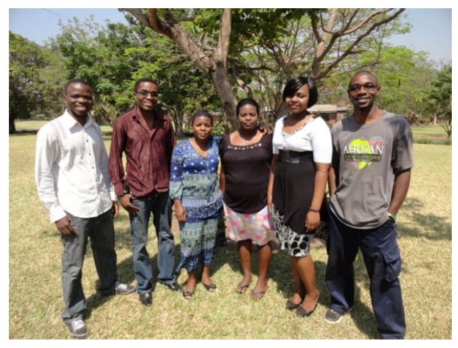
All six ABC students successfully graduated from the audiology program

• Our church growth group on a Tuesday night regularly has over ten members and there is a healthy sense of sharing, honesty and respect in the relationships.