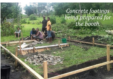
Concrete footings being prepared for the booth.