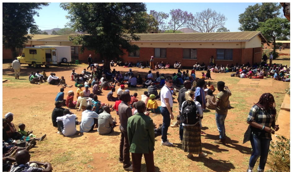
Waiting on the ground in the morning sun for ear and hearing care outreach clinic in Mponela. 250 people registered that day.