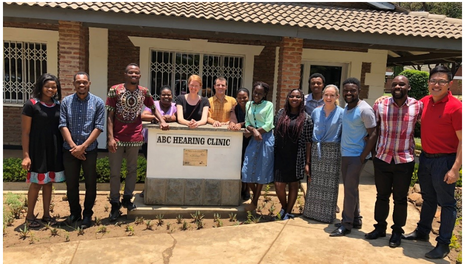
Staff and students of ABC Hearing Clinic and Training Centre