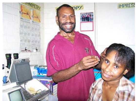
Performing Insertion Gain measurements to fit a hearing aid.

Given the Hearing and Speech Clinic was closed down in 2004 due to financial mismanagement, it was most pleasing to discover that, aside from a few questionable financial decisions, the clinic had been well managed in the last three years and was still adequately funded to provide ongoing services well into the future. The clinic aims to be financially self-sustaining and therefore charges small fees for the hearing services. This demonstrates to the community that the services are valuable, without becoming a burden to recipients.