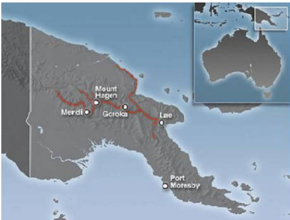
Map of Papua New Guinea, including Lae.