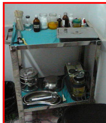
THE LIMITED ENT EQUIPMENT AT THE HOSPITAL

As a result of this visit David is considering taking a small team to Egypt in February/March 2010 but is waiting on advice from Egypt on what they consider to be the best time in those months to visit.